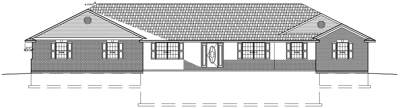
FRONT ELEVATION A-1